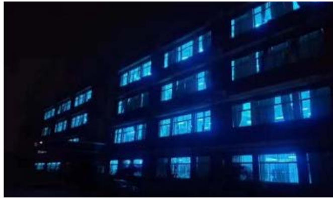
Application in hospitals: Hospital and Office building in Wuhan Pulmonary Hospital